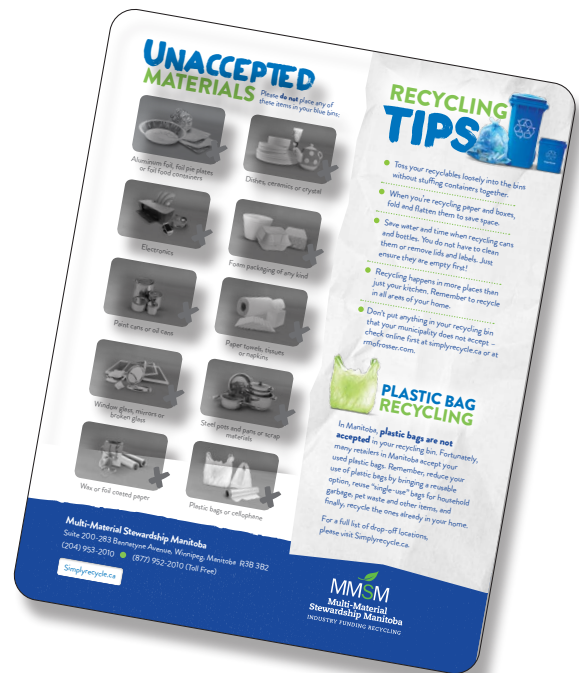
Knowing what you can recycle makes it easier. A recycling guide can be found on rmafrosser.com

In 2020, the RM diverted 38.27 tonnes of recyclable materials from the landfill and received $15,835.37 from the two organizations. The following year, 41 tonnes of recyclables didn’t go to the landfill and the RM got $17,234.22 in return. Last year, in 2022, 39 tonnes were diverted resulting in $15,891.72 coming back to the RM.