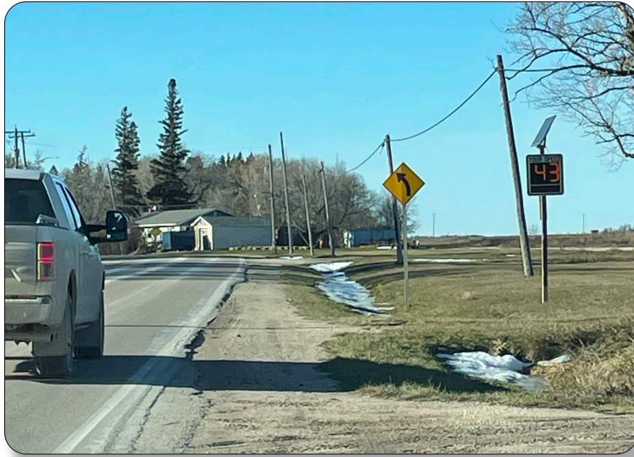
The speed sign on PR221 has motorists more aware of their speed and slowing down.

“The school is on 221, there are kids outside and the community centre is there too. No one wants to see an accident, and if the signs make drivers more aware of their speed and they take their foot off the gas, it’s a step in the right direction.”