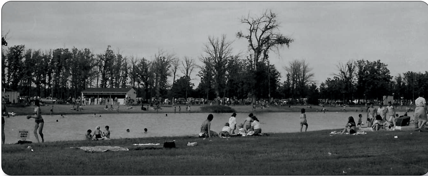
The photos above and at left show people enjoying a day at the Park Royale Beach in what is believed to be the early 1970s. The bottom photo shows the beach in September 1969.