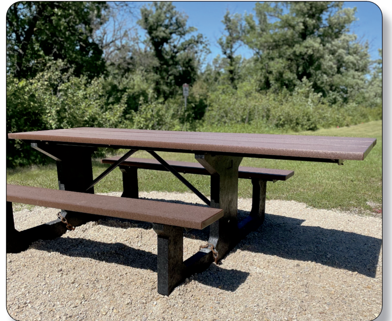
Clockwise from above, Coun. Lee Garfinckel presents the winner of the trails naming contest, Devon Hueging, with gift cards; a picnic table; a trail at the Rosser Community Friendship Park; an overhead view of the park with the trails indicated; and a perfect bench to stop and enjoy nature.